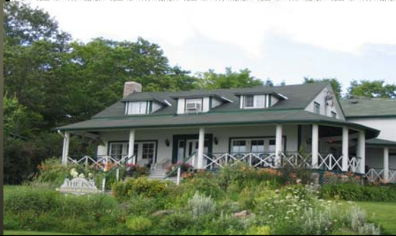
North Kawartha/KLT - Mt. Julian Inn art