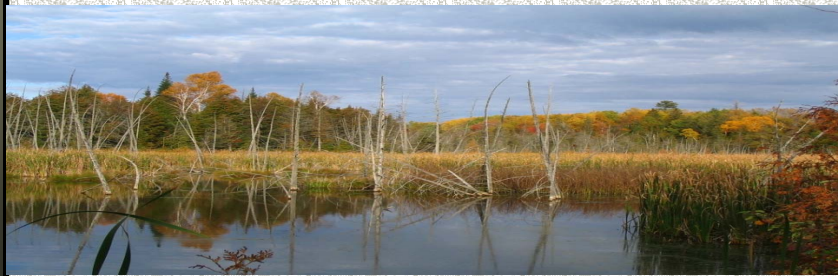
KLT – Dance Sanctuary