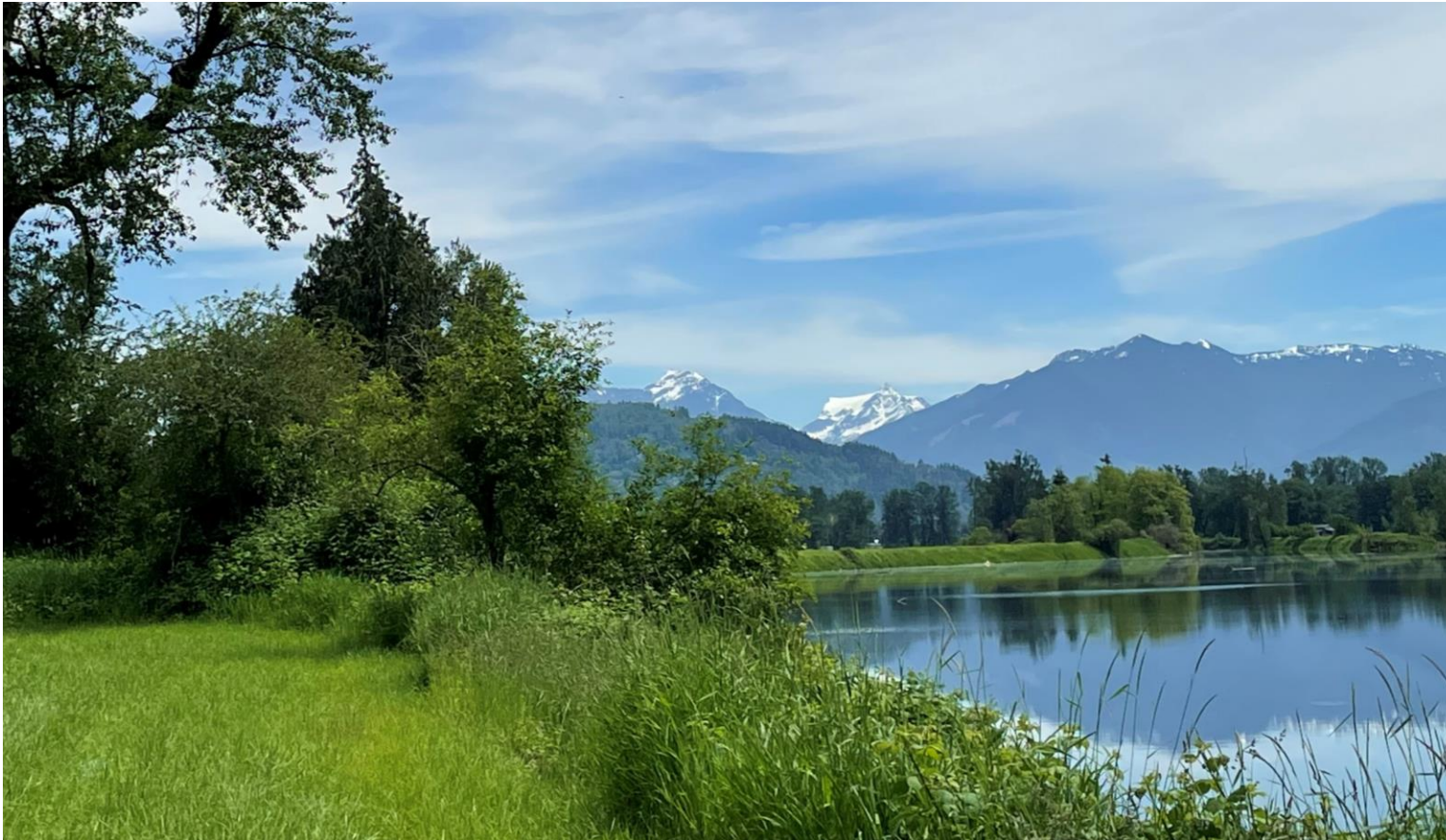
Nicomen Slough, BC (NTBC)

To protect and restore Canada's natural environment and biodiversity through land conservation.