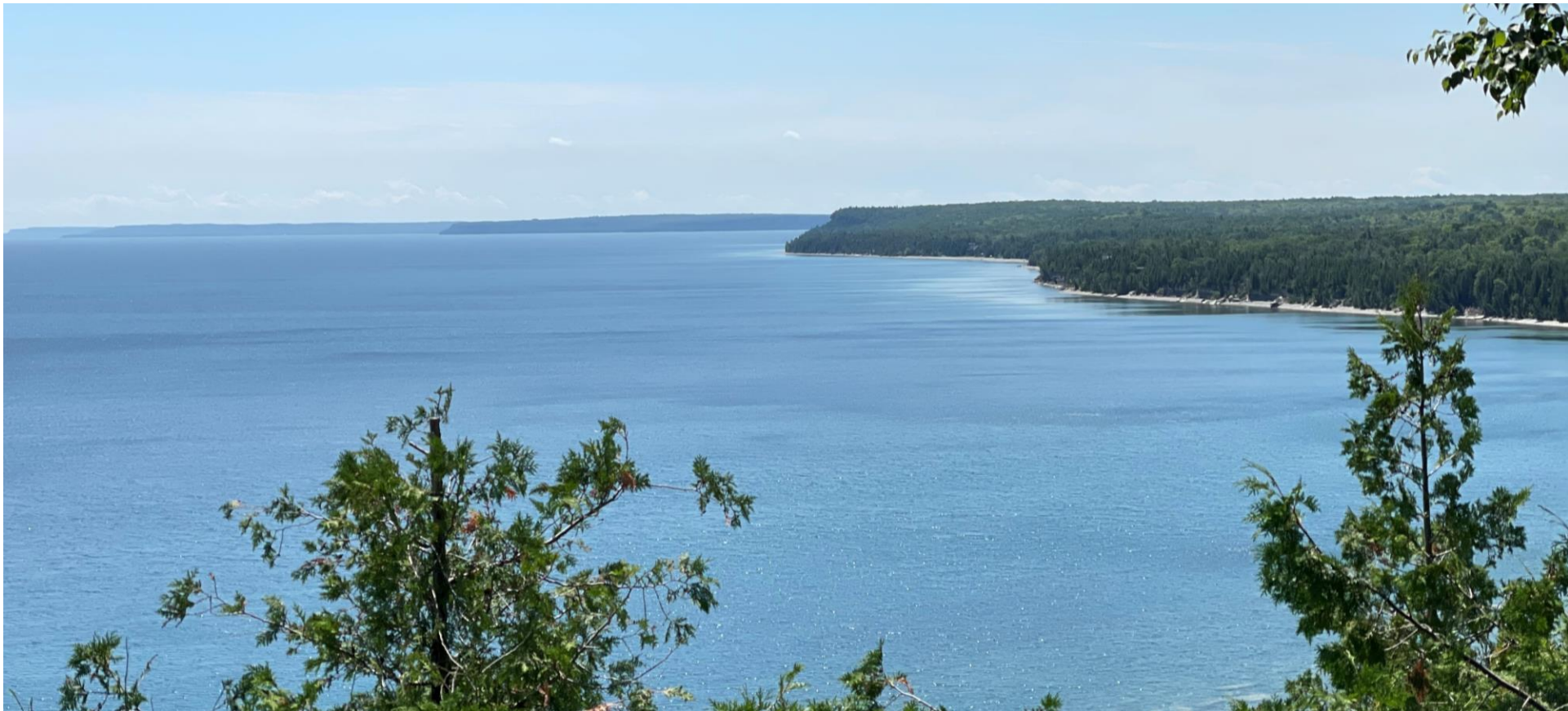
MapleCross Nature Reserve at Cape Chin, ON (BTC)

Investing in Canada – Investing in Nature