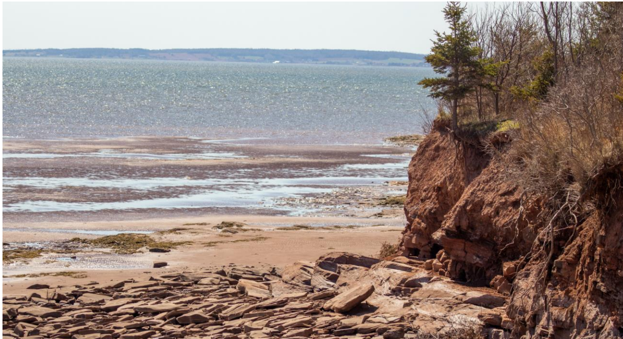
Wji'kijek- MapleCross Natural Area, PE (INT)