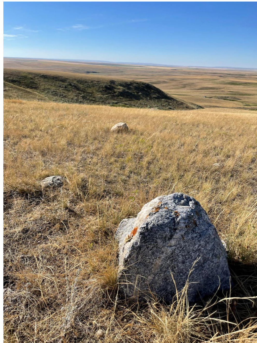
Rangeview, SK (NCC)