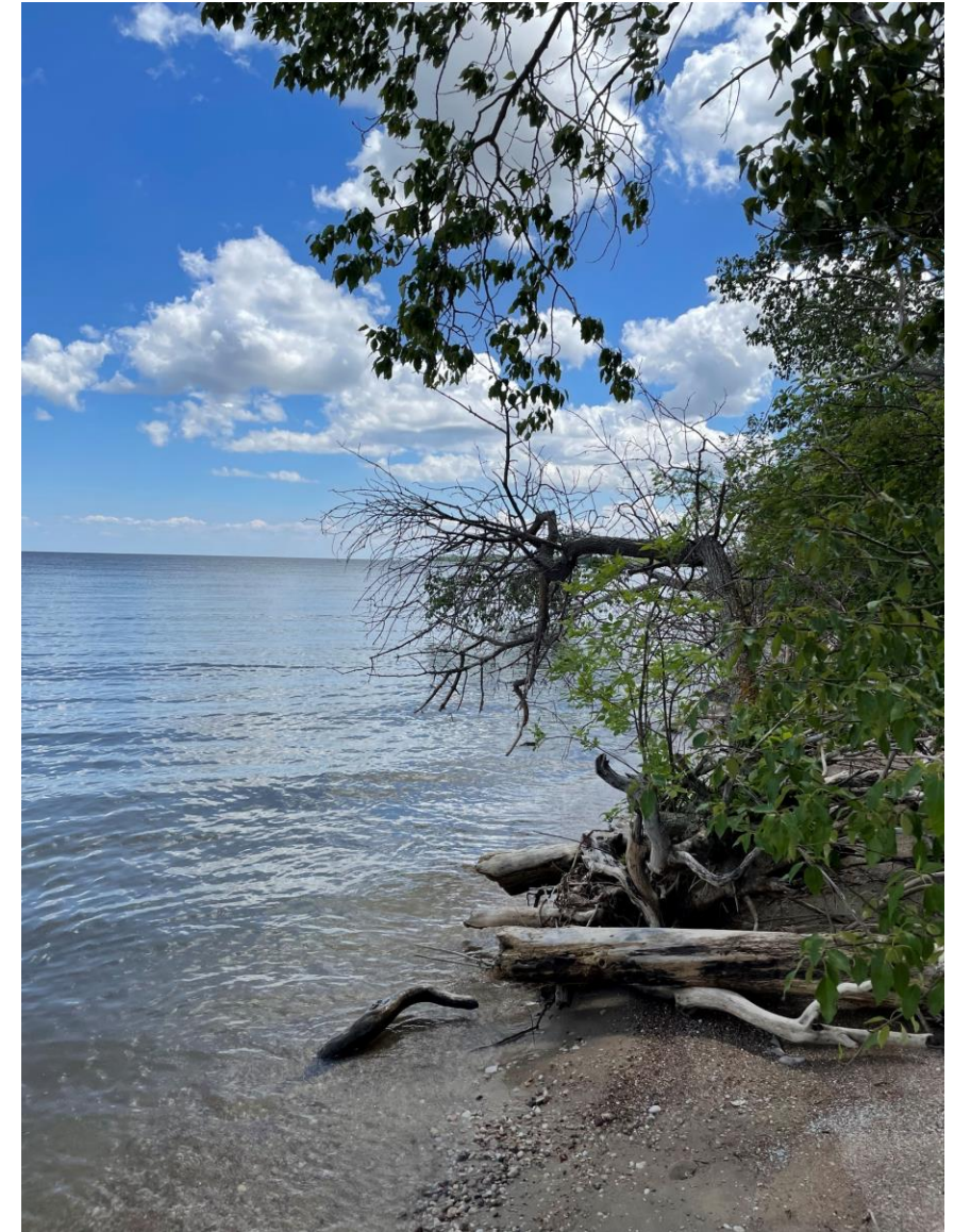
MapleCross Beach Ridge at Breda Bay, MB (NCC)