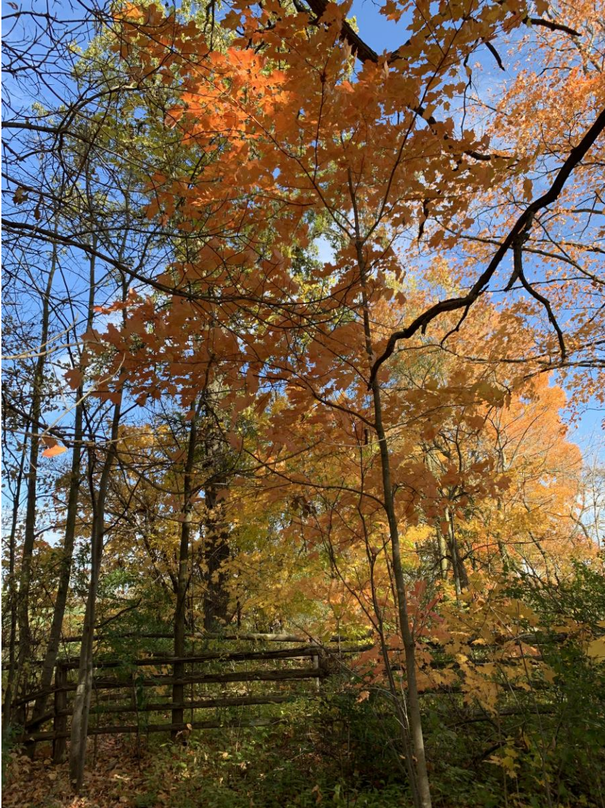
MapleCross Nature Reserve – King, ON (ORMLT)