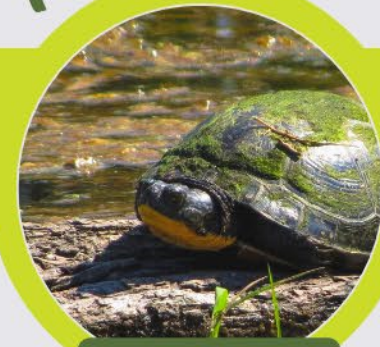
Blanding's Turtle (Threatened)