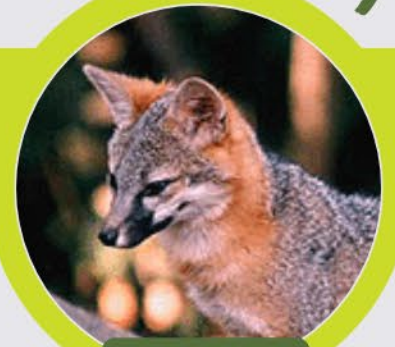
Gray Fox (Threatened)