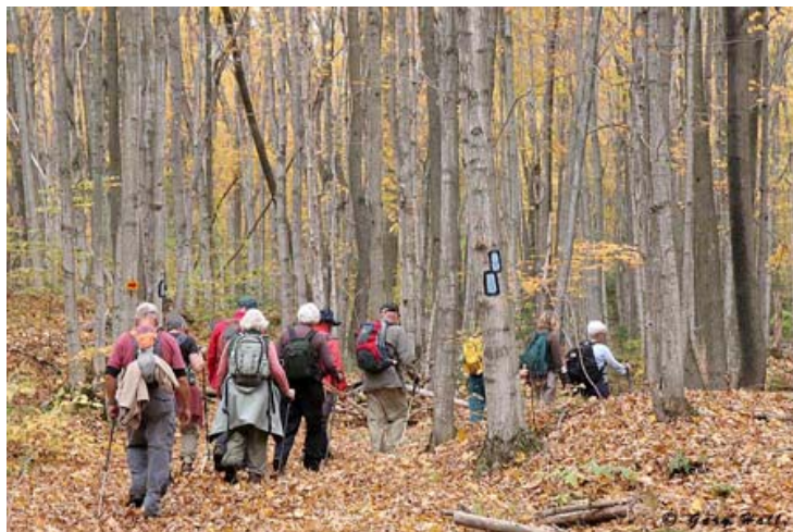
Caledon Club hike

The role of the Landowner Relations Director is maintaining good relationships with landowners. This is vital to the continuing existence of the Bruce Trail. Your role as a Landowner Relations Director is fundamental to the success of securing a permanent corridor for the Trail as well. This manual will explain your duties and suggest some of the best and most effective ways to carry them out