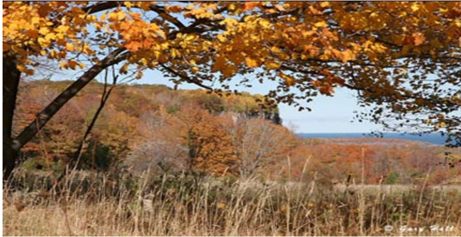
Boundary Bluffs – Peninsula

Authorities, Provincial, Federal or Municipal parks or other land trusts.