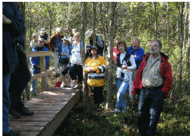
Caledon Club – Geology Hike

Part of the Landowner Relations Director's responsibilities includes obtaining permission to erect structures on the owners' property to accommodate the need for the improvement of the Trail or to allow for better, safer access. You will need to work closely with the Trail Director