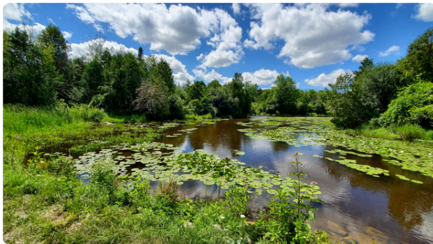
rare Charitable Research Reserve lands and waters conserved with the support of Greenlands Conservation Partnership