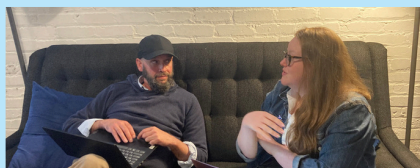
Our staff, 2023-2024