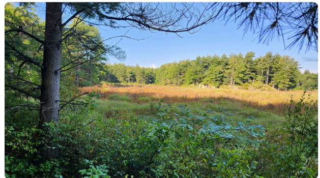
Thousand Islands Watershed Land Trust lands and waters conserved with the support of Greenlands Conservation Partnership

Through all its work, the Ontario Land Trust Alliance (OLTA) acknowledges and is grateful to all the original stewards of the land. For many thousands of years, Indigenous Peoples inhabited, cared for and used these lands and waters by applying original instructions, Indigenous knowledge systems and laws, and they continue to do so. OLTA also acknowledges those Indigenous Peoples, and other peoples who currently live, work, play and learn on the lands around us. We are grateful to work in this community, and we remain dedicated to the continuous journey of reconciliation with all Indigenous peoples.