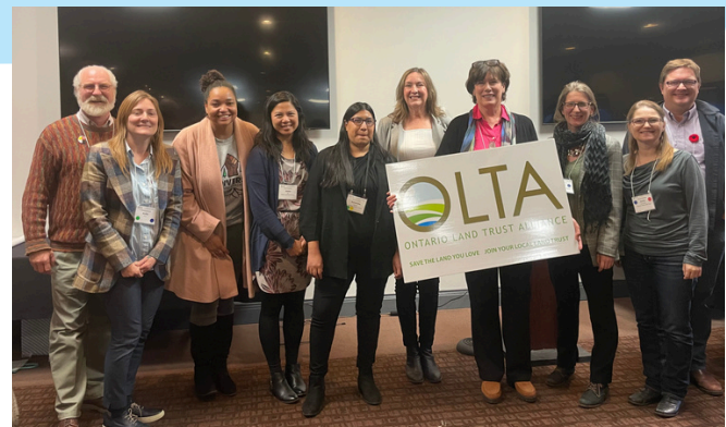
Our Board of Governors, 2023-2024