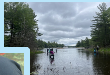
Staff and Board Retreat 2024