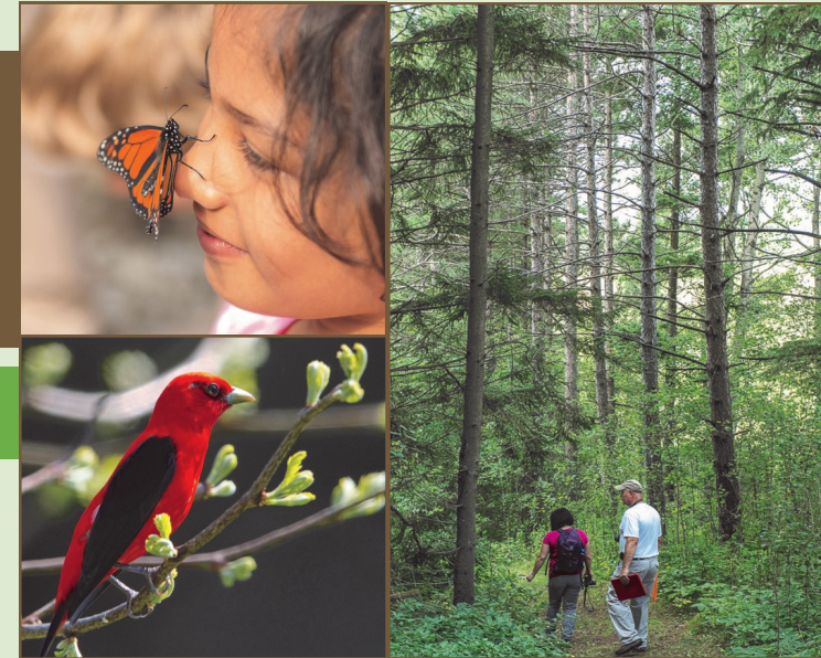
Clockwise from bottom left: Scarlet Tanager, Monarch on face ; Oak Ridges Moraine Land Trust forest trail

Thank you for helping to save the land you love in Ontario !