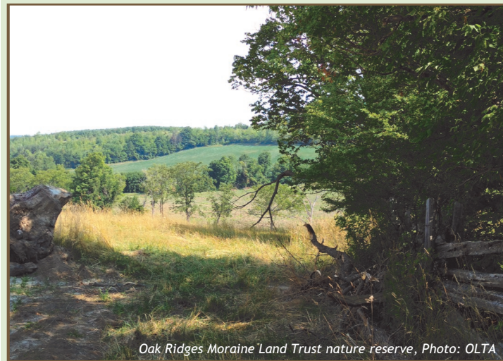
Oak Ridges Moraine Land Trust nature reserve