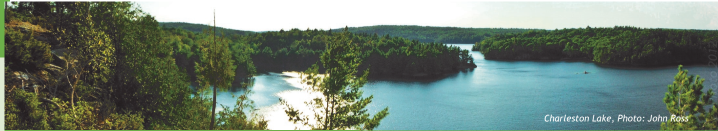
Charleston Lake